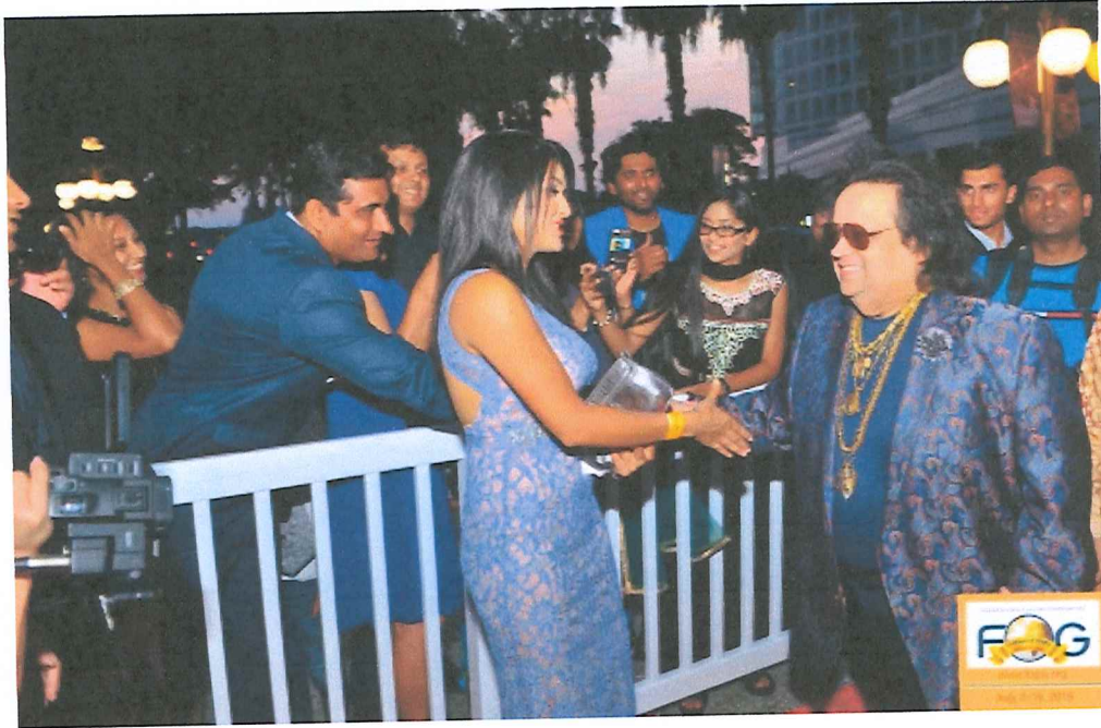
Bappi Lahiri gets a red carpet welcome at 2015 Festival of Globe.

MB: How did the idea for this festival come about?