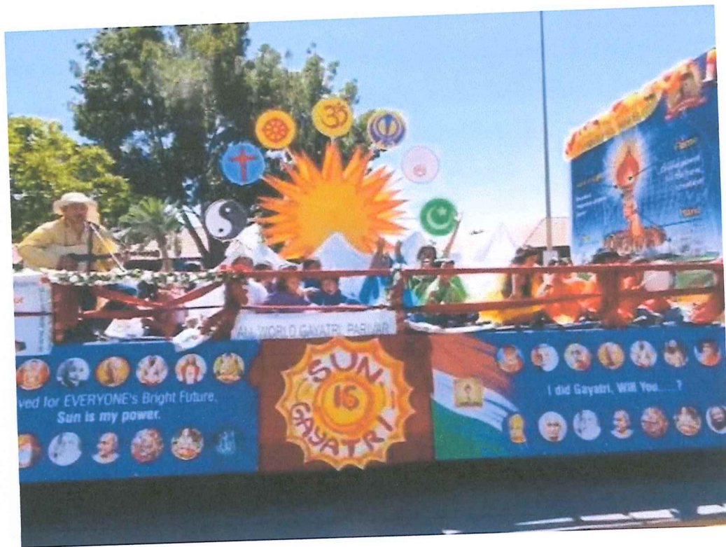
A float from a previous parade.

RJ: It has been a wonderful journey. In 1993, it started with the parade and fair with 5,000 attendees. Last year, we had 150,000. FOG Movie Fest was added in 2014 and now we have 12 different verticals as part of FOG Extravaganza.